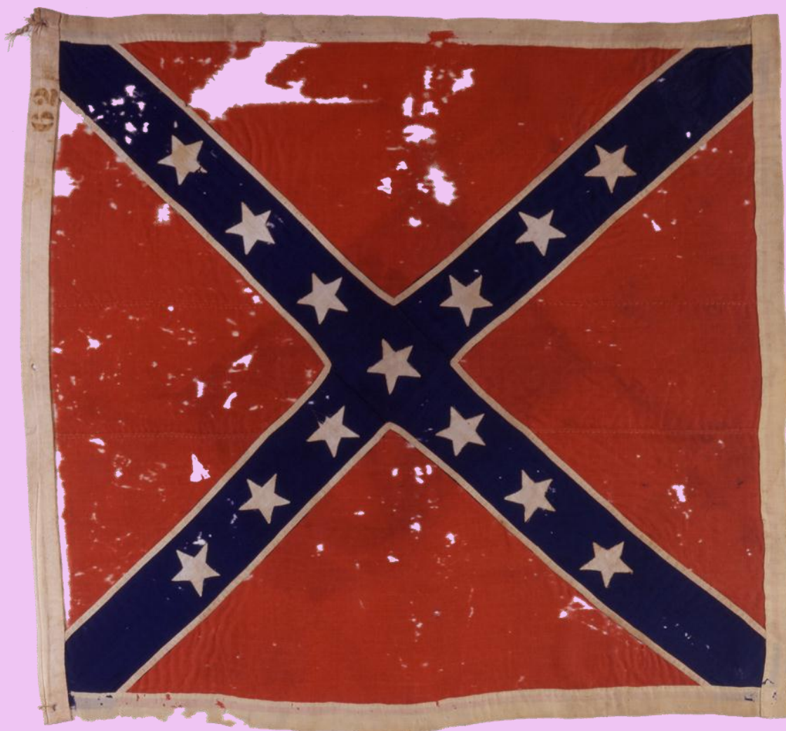
THE BATTLE FLAG OF THE 26 TH NORTH CAROLINA REGIMENT